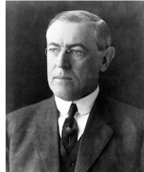
President Woodrow Wilson articulated a new basis for America’s relationship to the world: the mission of making the world “safe for democracy.”