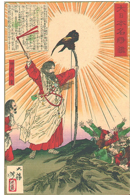
A famous depiction of the first emperor, Jimmu, shown with a bow and a three-legged crow— considered a mystical creature in Shintoism.