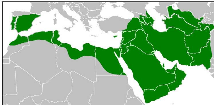
The Muslim empire or “Caliphate” created by Muhammad and his successors (the “califs”) stretched from Iberia in the West to India in the East.