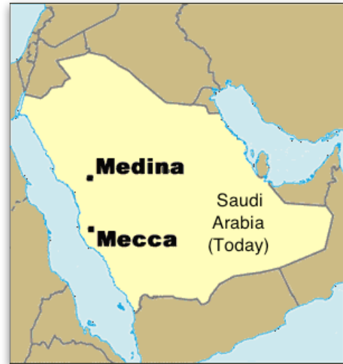
A map of Arabia, with present day borders indicated, shows the locations of Mecca and Medina, where the story of Islam begins.