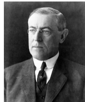
President Woodrow Wilson articulated a new basis for America’s relationship to the world: the mission of making the world “safe for democracy.”