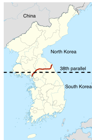
The Korean War (1950-3) ended with Korea divided into two countries with a military stand-off at the 38th parallel.